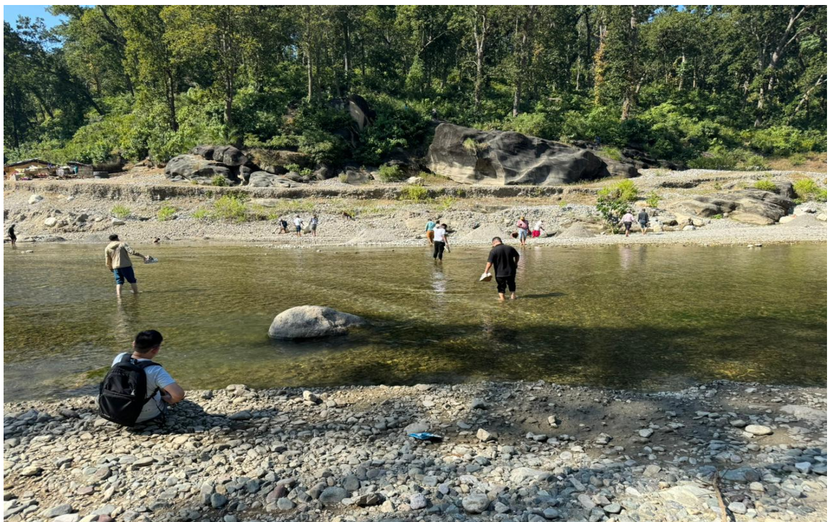
Figure 4 Site visit (crossing Jhupra river)