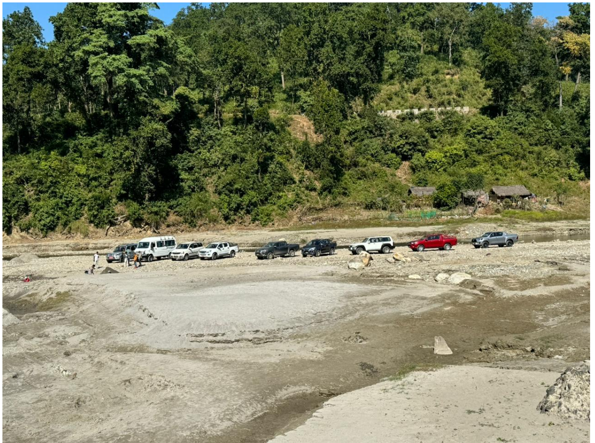
Figure 3 site visit