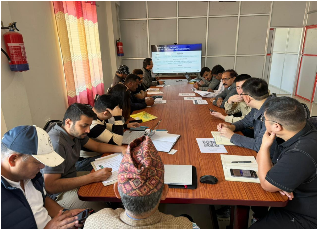
Figure 1 Commencement of the Program

Photographs of the event is shown below: