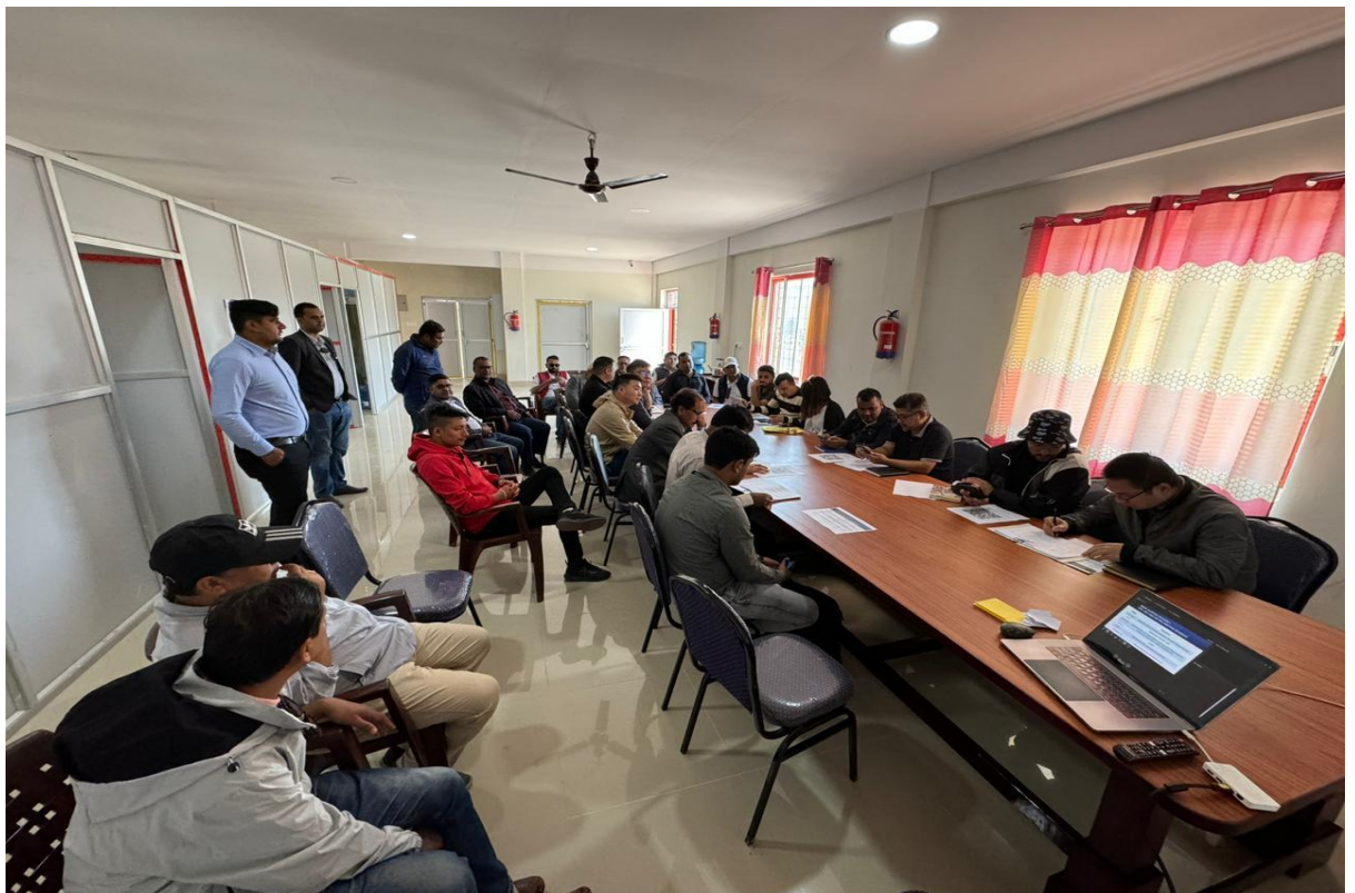
Figure 2 Presentation of project to the interested bidders by MST team leader